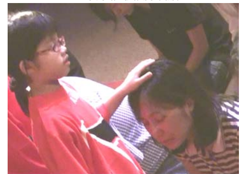
Children released to pray for the mission team leaders