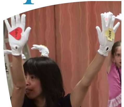
Learning that God is Love and also Just